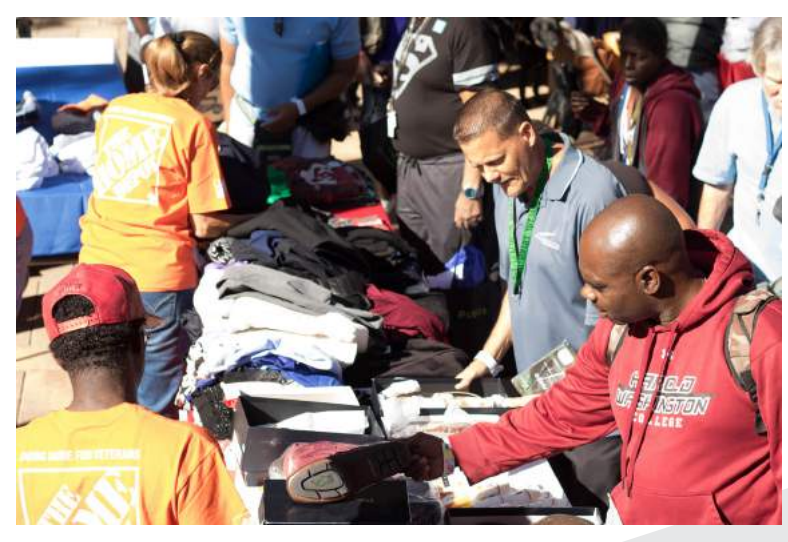
Three volunteers oversaw the DVNF distribution tables and assisted veterans in being judicious with their selections. All the men's t-shirts were snapped up right away!