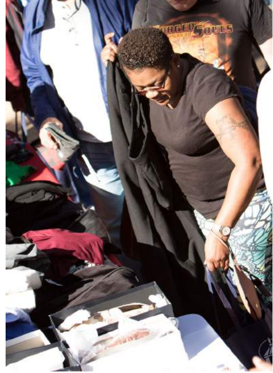
This woman was so pleased with the Talbot clothes, that she tried on items right over her own clothes!

"It is an honor to be part of an event where we can give and offer so many resources. I was overwhelmed with emotion as I watched veterans pour into the event, and many of them benefited from DVNF's gifts, bringing smiles to many. Thank you for being a partner in our stand down!"