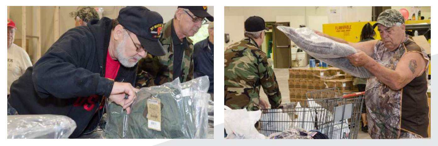
These men from local veteran organizations look through the cargo pants and blankets.

"Thank you to the Disabled Veterans National Foundation on such an outstanding gesture to help our veterans. God bless you for all you do!"