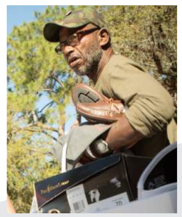
The men's and women's shoes were a big hit! By the end of the stand down, most of the items were gone.

"The items donated by DVNF are still helping veterans. From the few shoes and clothing items leftover from the stand down, I just provided clothes and shoes to lady veteran going for a job interview. Thanks for everything you people do."